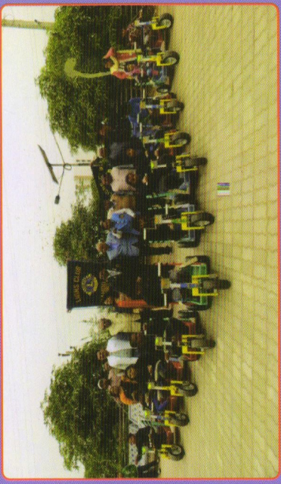
Mobility Cart (Tricycle) made in Holland Distributed to the Needy