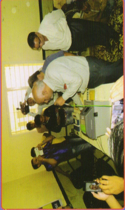
Awareness of Voting on newly arrived Voting Machine