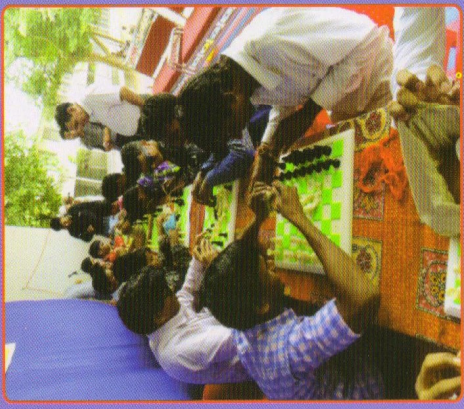
Chess Tournament for the Blind

The Trust is grateful to all donors. The support of Society and Government is necessary for the progress of the trust. Whatever achievement, the Trust has made is due to your Co-operation and it is desired that we will receive your support to complete the above Projects. We hope that you will share this with your family members and friends. In the past we have received great support from all of you for the construction work of about Rs. 2 crores. I would like to inform you that institution has FCRA Registration (so that we can collect funds in foreign currency itself) For our donors to avail 50 % exemption we have 80 G of Income tax. So I have pure faith that you will donate generously for the betterment and progress of the disabled of this area.