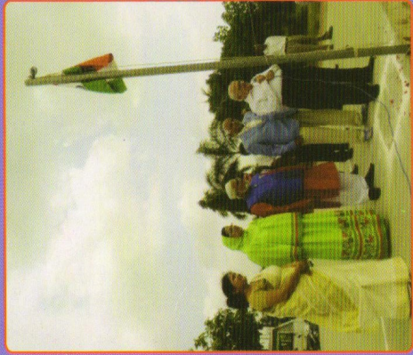
Flag Hoisting and Parade on Independence Day